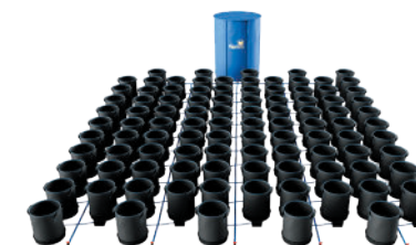
100Pot XXL 13 (13 gal pot - excl. adaptive collar)