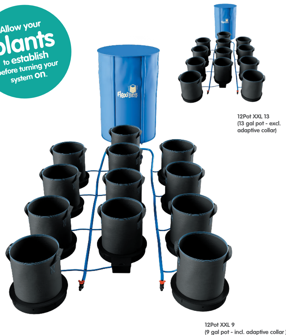
12Pot XXL 13 (13 gal pot - excl. adaptive collar)