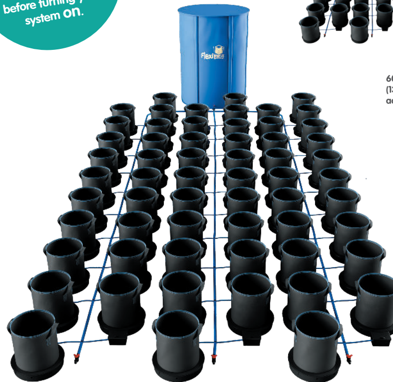
60Pot XXL 9 (9 gal pot - incl. adaptive collar)