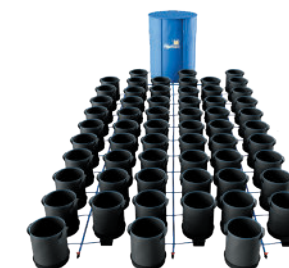
60Pot XXL 13 (13 gal pot - excl. adaptive collar)